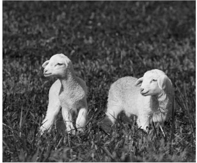
The Israelites slew a young lamb and smeared its blood on the doorposts of their houses.

But while the night lasted, they could not leave their houses. The reason was that on that night, the