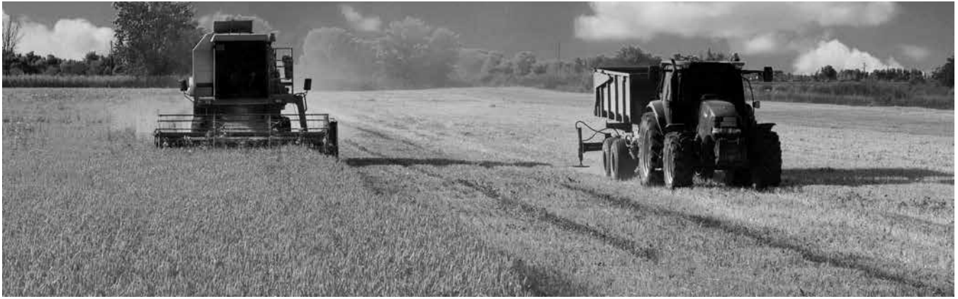
The grain harvest pictures the future spiritual harvest of human beings to be born into the God Family.

Write out this important promise God made in John 14:16: _____ _____ _____