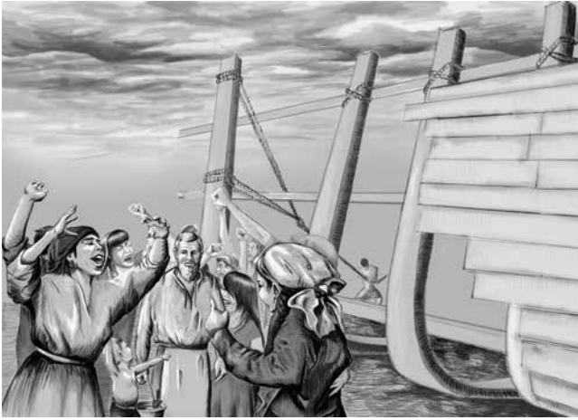
All of humanity mocked Noah for building the ark, but in the end only he and his family were spared.

was _____; for all _____ had _____ his [God's] way upon the _____. And God said unto _____, The _____ of all _____ is come before me; for the _____ is filled with _____ through them; and, behold, I will _____ them with the earth. Make you an _____ of _____ wood....”