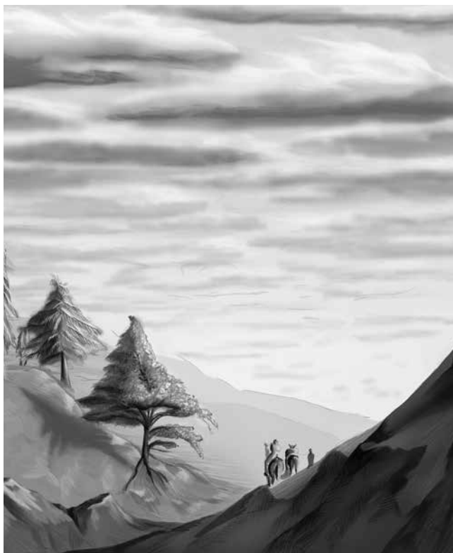
Abraham and Isaac leave for Mount Moriah early in the morning.

But Abraham trusted God. God promised that Abraham would be the father of many nations, and they would come through Isaac. Abraham knew that