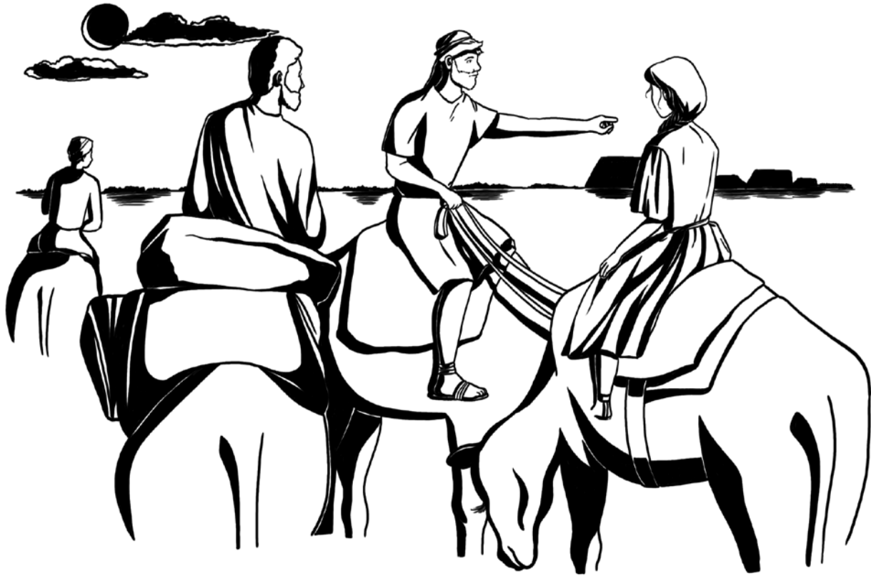
Jacob leaves Midian.

Another lesson from Jacob's life is to work hard. God blesses you if you follow His laws, work hard and treat people fairly. You might have to be patient, but God will always bless you when we you do the right thing.