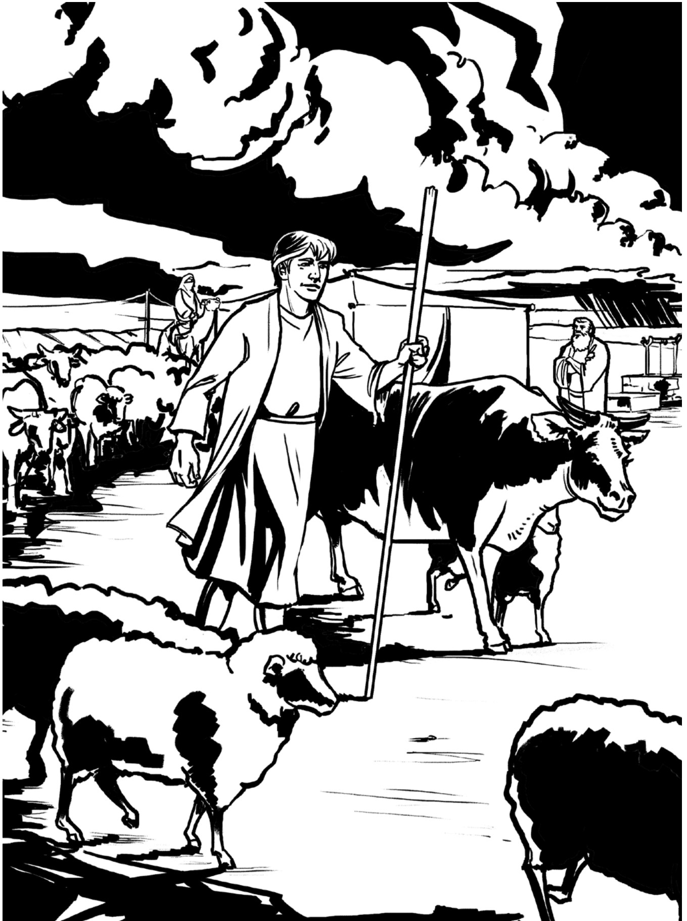
Jacob works for Laban seven years so he can marry Rachel.