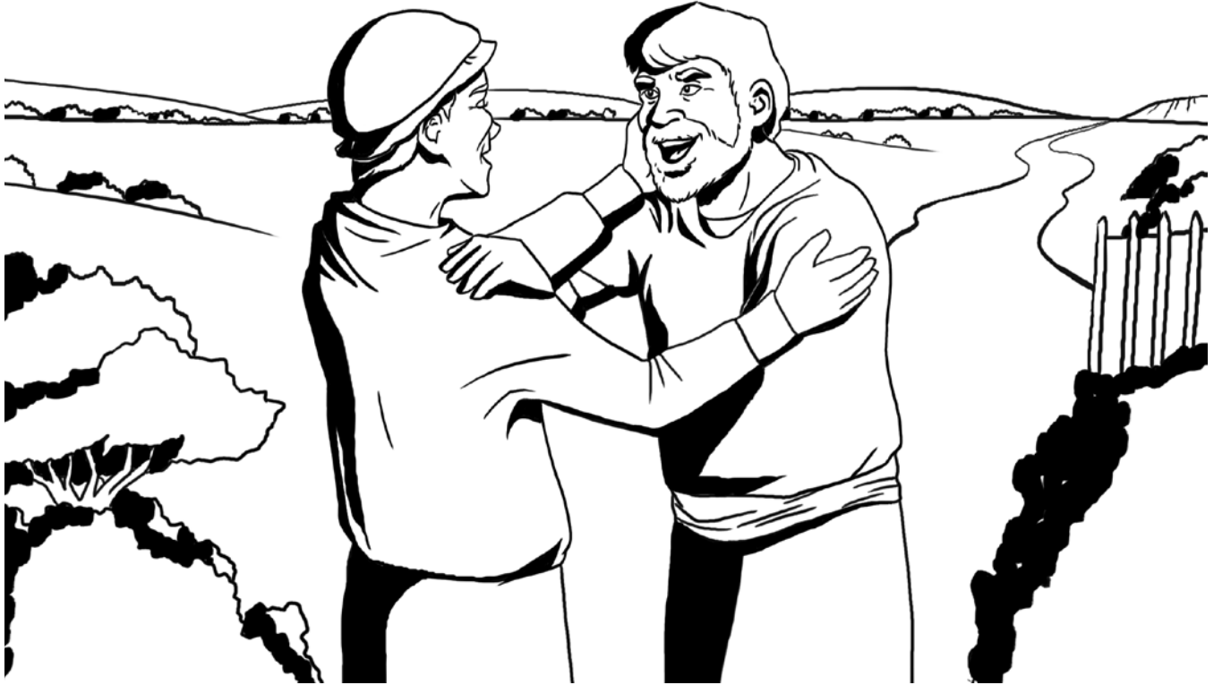
Jacob and Esau reunite.

to harm the other. Then they shared a meal together and went their separate ways.